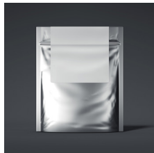
EB-CURABLE RESEALABLE ADHESIVES