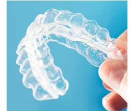
NEW ENGINEERED AND CUSTOM LIQUID RESINS FOR 3D PRINTING