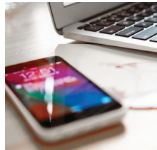
LATEST DEVELOPMENTS FOR OPTICALLY CLEAR SYSTEMS