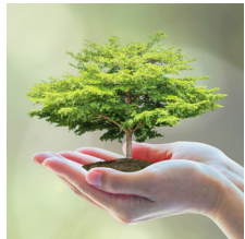
SUSTAINABLE AND COMPLIANT SOLUTIONS